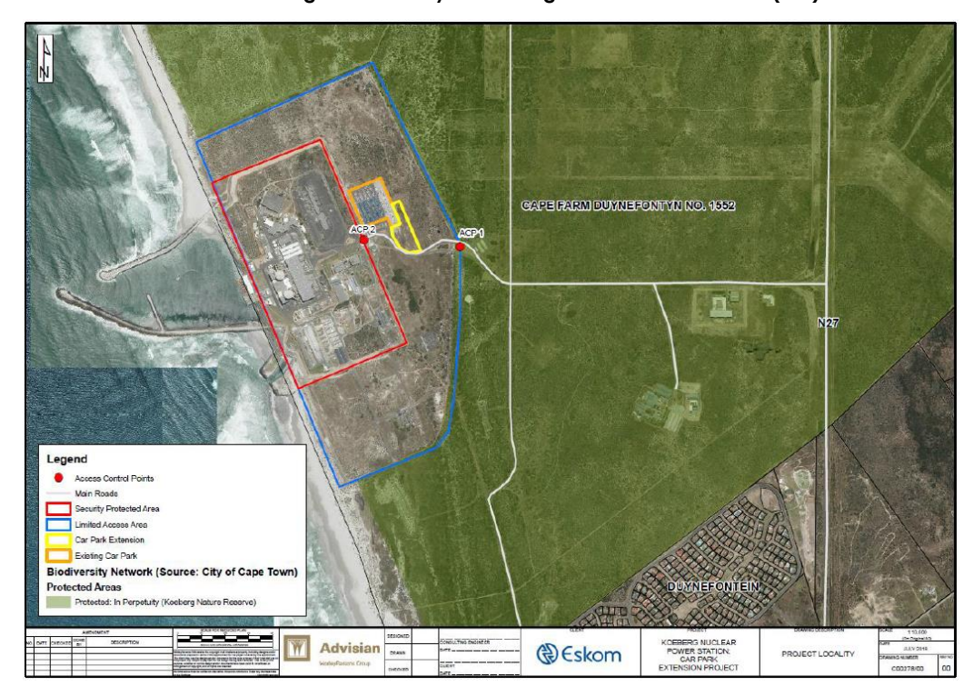
Figure 2: Site locality within Koeberg Nuclear Power Station.