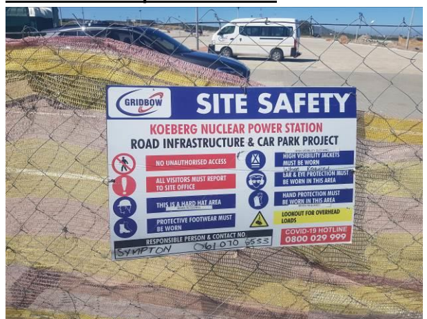
Image 1: Site notice warning KNPS employees of the presence of a construction site.