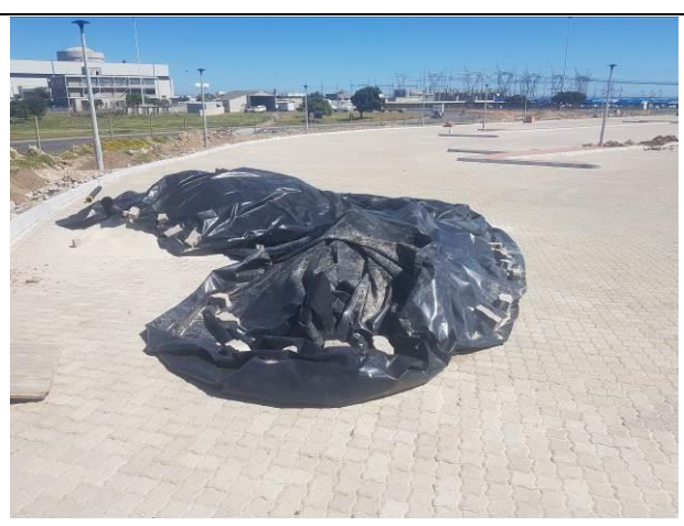
Image 9: Material stockpile protected from wind and water erosion.