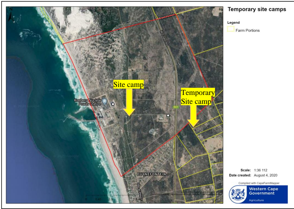
Figure 3: Location of site camp.

The main site camp is situated within the existing car park (33° 40' 26.84""S, 18° 26' 11.39""E), a temporary site camp was located along the entrance road (33° 40' 37.12"S, 18° 27' 12.8"E) during the early phases of the project. The temporary site camp situated along the entrance road was located on ground that was previously disturbed.