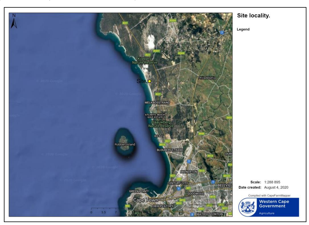
Figure 1: Locality of Koeberg Nuclear Power Station (site).

• Cape Farm Duynefontein No 1552, portion 0